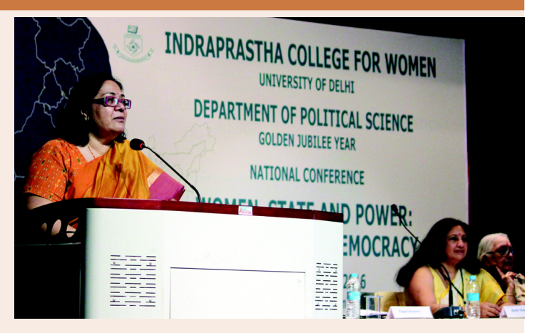
NCW Chairperson addressing the conference

In the inaugural session, the conference's topic - Women, State and Power: Reflections of Democracy was discussed. It was deliberated how patriarchy played a major role in the democratic set up of the country which excluded women from gaining any benefit of democracy and how in India equal rights were denied to women.