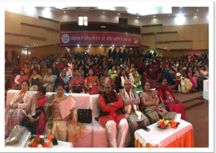
Glimpses from the ceremony of 'We Think Digital' launch at Lucknow organized by NCW