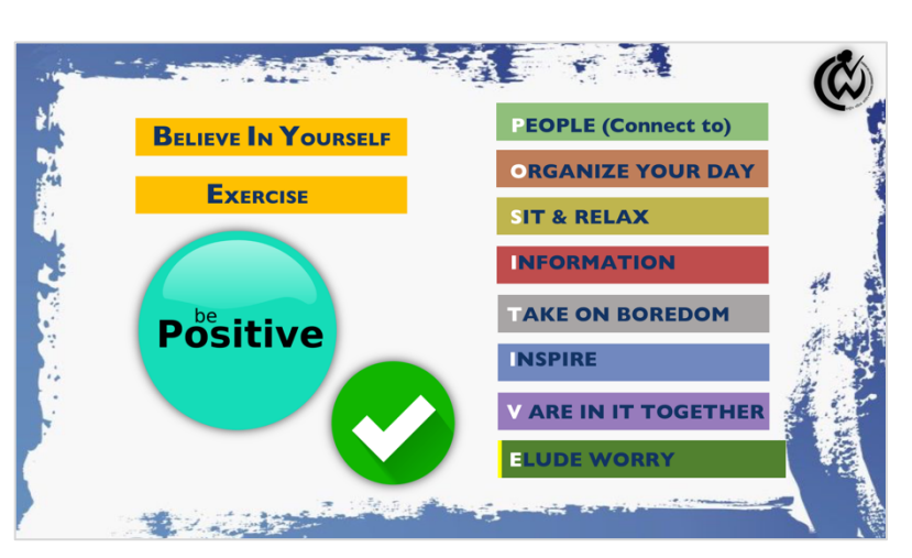
The mantra of 'BE POSITIVE' to fight stress

The situation around COVID19 pandemic and the lockdown imposed to contain the spread of the virus had bought several challenges particularly for women in dealing with daily routine like home-schooling kids, work-from-home schedule, household loads, family care and while some also experienced domestic violence. With an effort to reach out to women in distress especially at times like these, NCW released a 5'minute video on 'Psychological Wellbeing Strategy' in consultation with Psychiatrists from PGIMER Chandigarh, on dealing with mental stress and wellbeing amid the lockdown period. The video advises women on various techniques to deal with stress, strategies to overcome anxiety and mental breakdown and on ways to remain positive and productive while caring for the wellbeing of themselves and their loved ones.